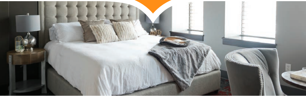
The Flats Luxury Suites