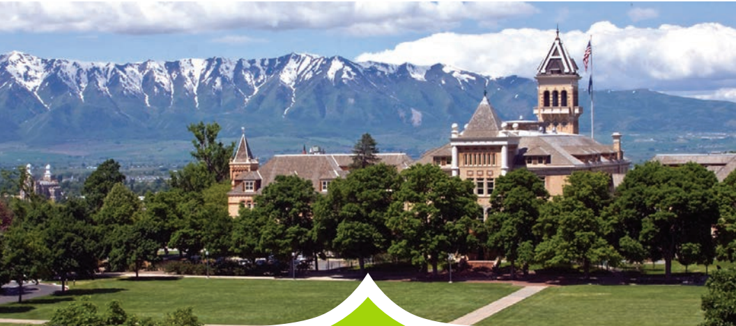
Old Main at Utah State University

Utah State University Special Collections Merrill-Cazier Library, (435) 797-8248, archives.usu.edu . Features historical documents, photographs and the skull of Old Ephraim, the legendary giant grizzly bear that terrorized sheep in the region.