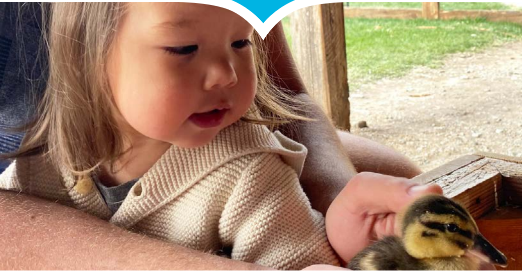
American West Heritage Center