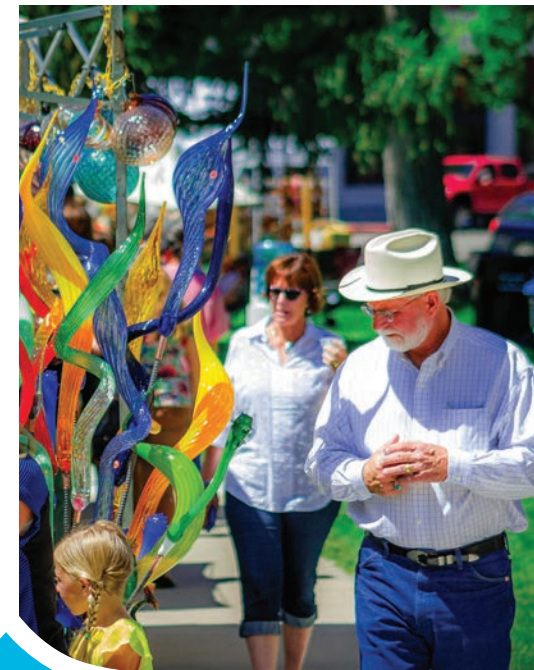
Summerfest Arts Faire

419 West 700 South, (435) 750-9894 zootah.org Beautiful, park-like acres with lots of shady trees surround this small but impressive zoo.