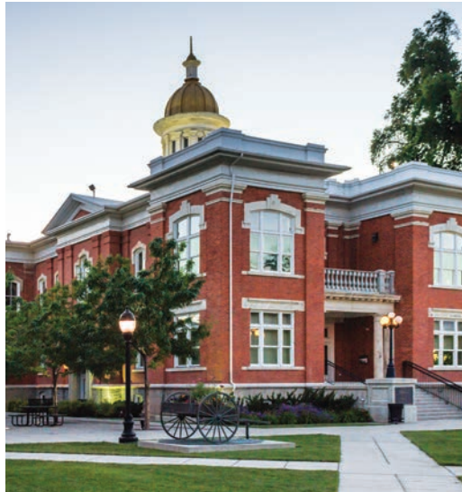
Cache County Courthouse and Visitors Bureau

Stop by the historic Cache County Courthouse for insider information. Get the scoop on local favorites to make it your best vacation ever. Just get here!