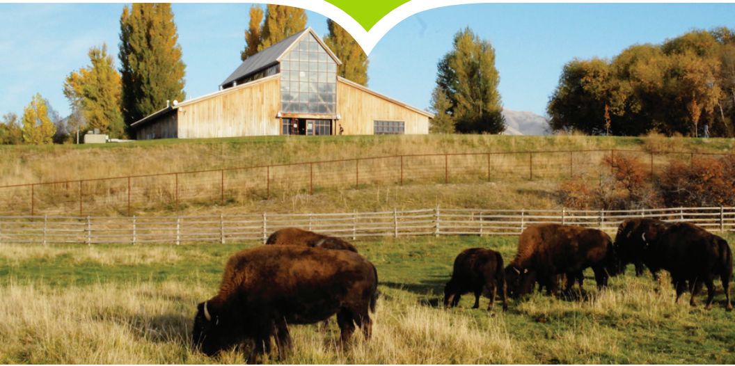
American West Heritage Center