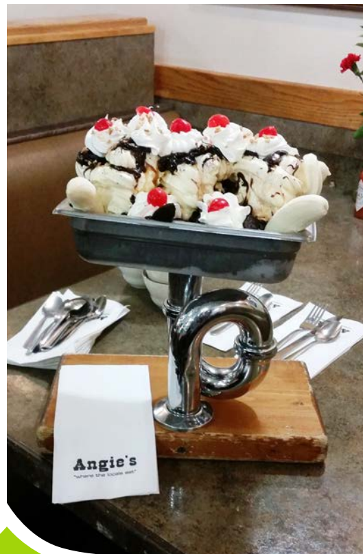
Angie's Restaurant: The Kitchen Sink