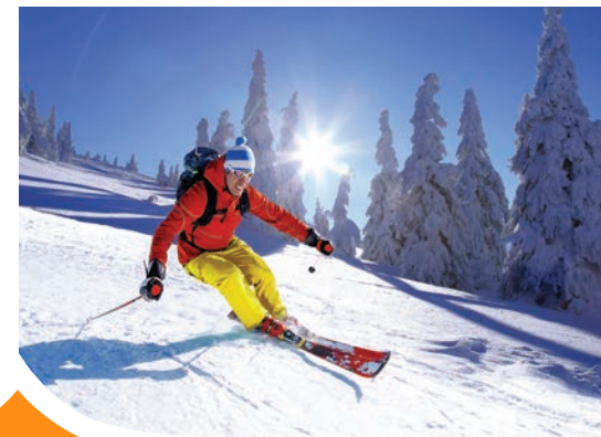
Hit the Slopes

Discover a piece of natural history or take in the beauty of the surrounding area at Stokes Nature Center. Make friends with live reptiles and amphibians, learn about rocks and fossils and enjoy the native plants and animals along the Logan River. 2696 East U.S. Hwy. 89, 1 mile up Logan Canyon, (435) 755-3239, logannature.org