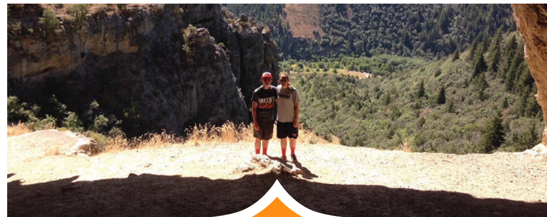
View from Wind Caves

Bonneville Shoreline Trail —This 2-mile trail runs from Logan Canyon to Green Canyon and starts at Canyon Entrance Park, U.S. Hwy 89 and Canyon Road (First Dam).