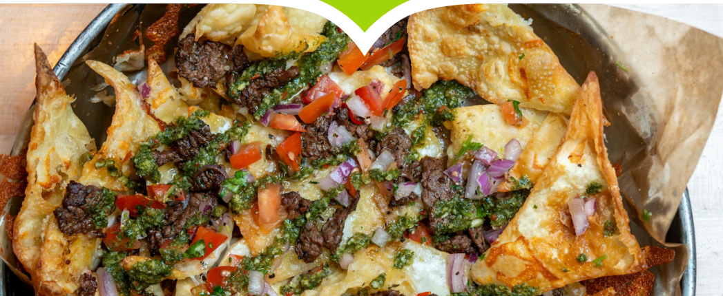
Ruby's Pizzeria & Grill