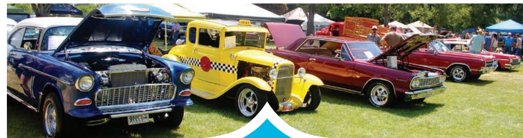
Cache Valley Cruise-In

Logan's Freedom Fire Fireworks Show , (held July 3rd), (435) 716-9250, loganutah.gov . A patriotic celebration with spectacular fireworks and live performances.