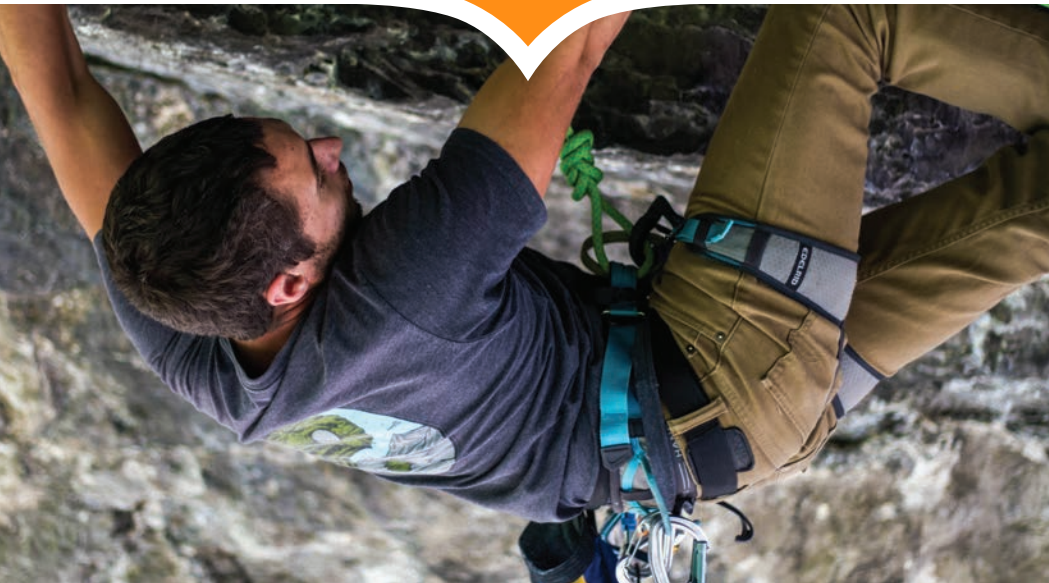
Rock Climbing in Logan Canyon