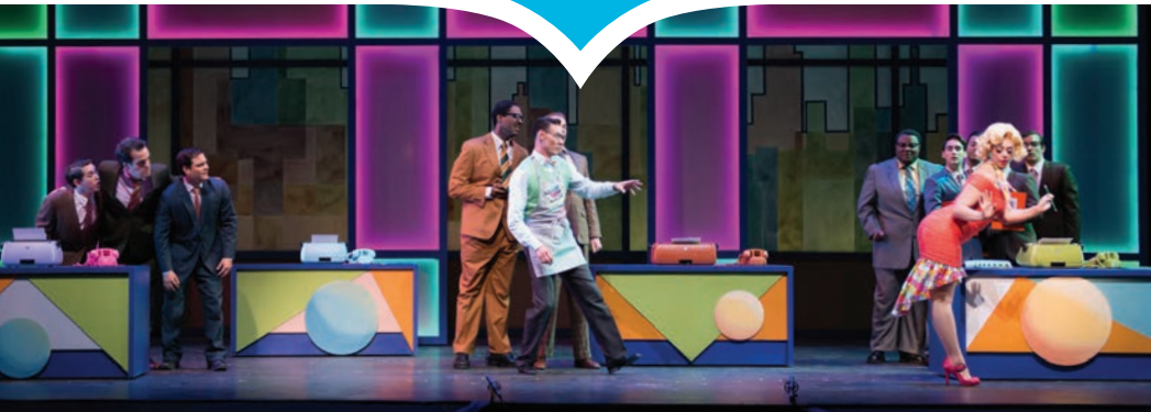
Utah Festival Opera & Musical Theatre