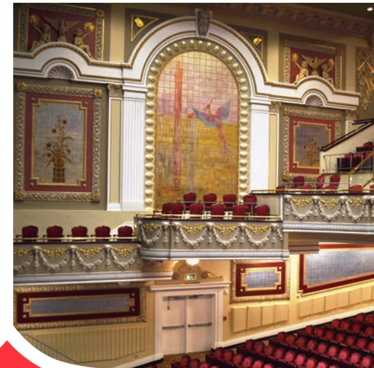
Ellen Eccles Theatre

Tippetts & Eccles Galleries , Chase Fine Arts Center, Utah State University, (435) 797-3040