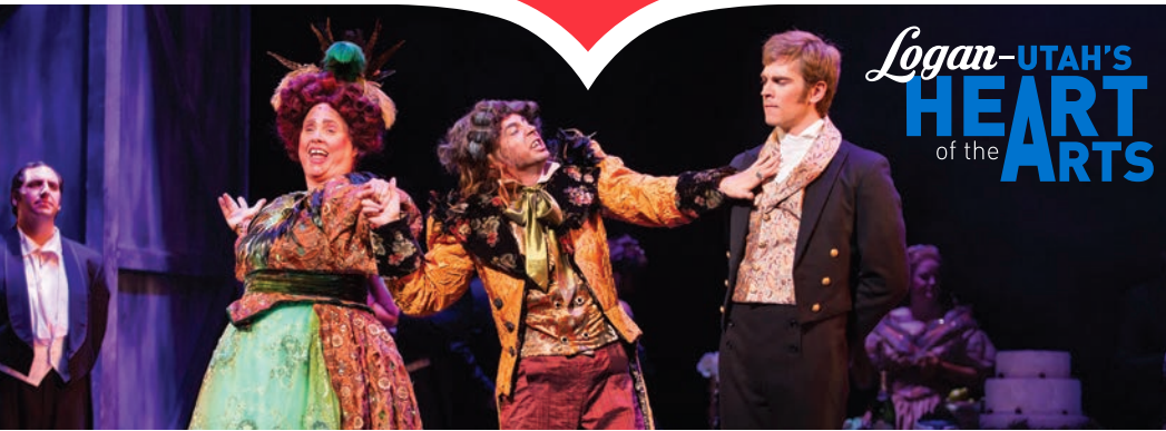
Utah Festival Opera &amp; Musical Theatre