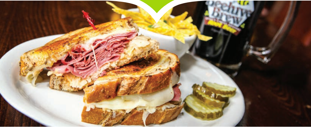
Beehive Pub and Grill