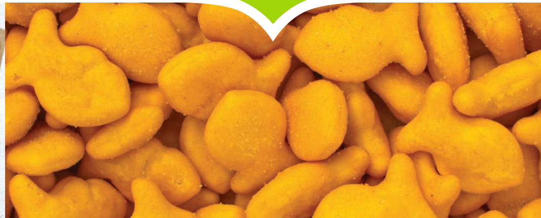
Pepperidge Farm Outlet