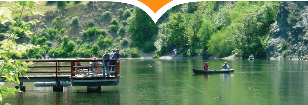
First Dam in Logan Canyon