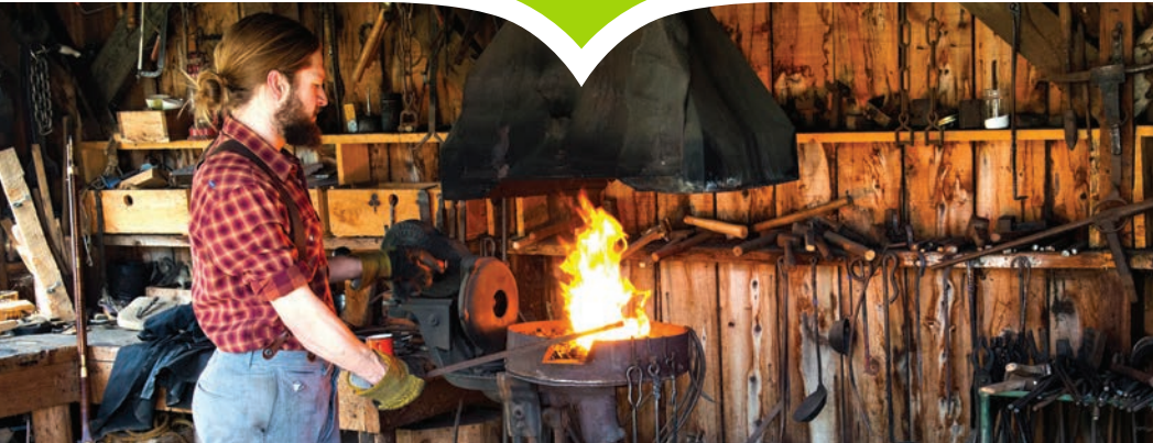
American West Heritage Center