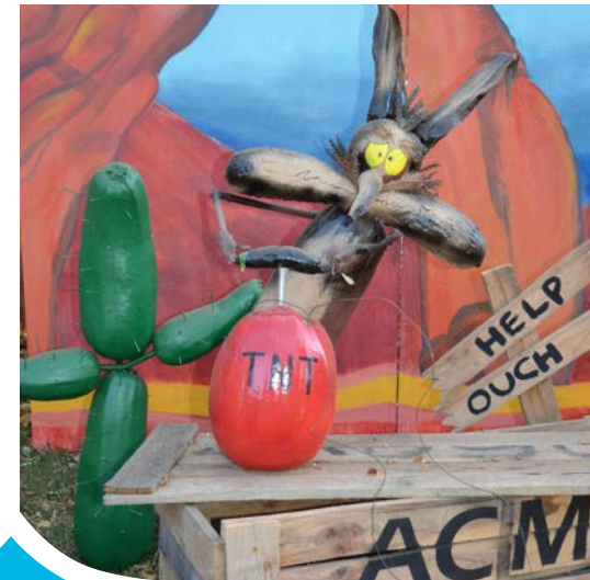
North Logan Pumpkin Walk

Celebrate the holidays with dozens of concerts and performances and the Parade of Gingerbread Homes; full details at explorelogan.com