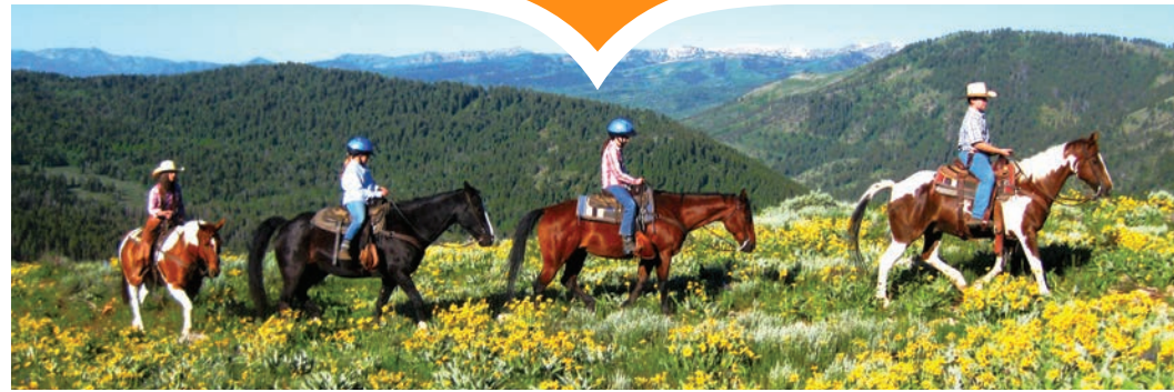
Horseback riding with the team from Beaver Creek Lodge

Hyrum State Park —This beautiful 450-acre manmade lake offers boating, year-round fishing, waterskiing, camping and swimming. Facilities include a 32-unit campground with one ADA site, modern restrooms, showers, two cabins, a concrete boat ramp and a sandy beach. Group camping area available by reservation. Located 15 minutes from