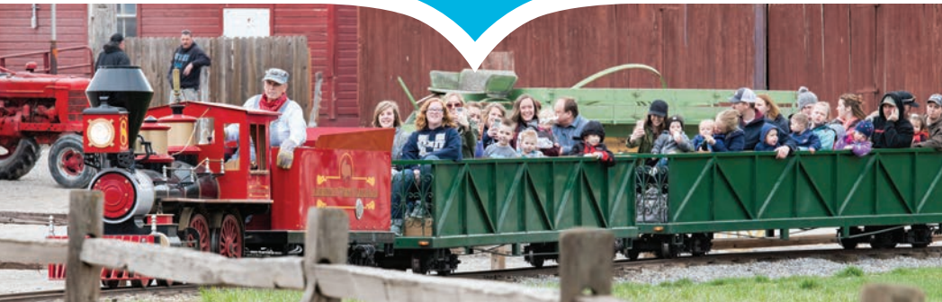
American West Heritage Center