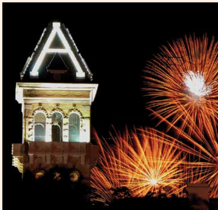
Old Main at Utah State University