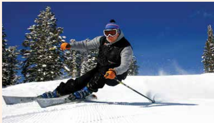
Beaver Mountain Ski Resort

27 miles east of Logan, 15 miles west of Garden City on U.S. Hwy 89, Logan Canyon (435) 753-0921; (435) 753-4822 for 24-hour ski report December-March, daily, 9 a.m.-4 p.m. closed Christmas Day