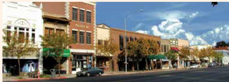
Historic downtown Logan

Center is nestled into the beautiful campus of Utah State University overlooking charming Cache Valley. When you stay at the University Inn & Conference Center you're just a few steps away from all campus facilities and events. Whether visiting for business, vacation, or hosting your next conference, we invite you to experience our warm hospitality, personal customer service and peaceful night stay. Services and amenities include 24-hour guest service, continental breakfast and complimentary wireless internet. Each hotel guest receives complimentary covered parking and a scoop of famous Aggie ice cream.