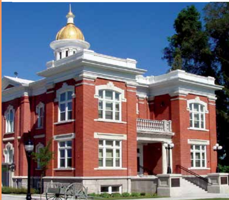
Cache Valley Visitors Bureau and Gift Shop