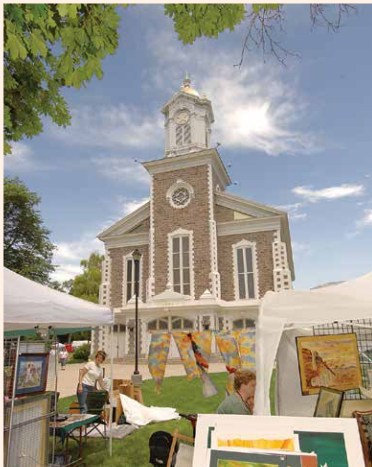
Summerfest Arts Faire

PAPA KELSEY'S PIZZA AND SUBS 165 East 1400 North, Logan (435) 752-3525 Mon.-Thurs. 11 a.m.-9 p.m. Fri.-Sat. 11 a.m.-10 p.m. Pizza, subs and breakfast burritos